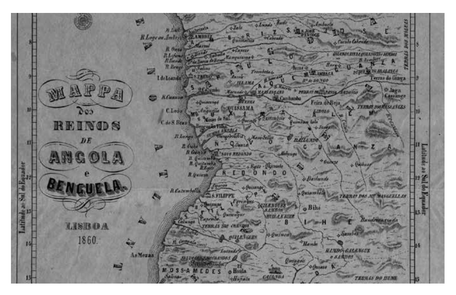
2 Detail of Map of Portuguese Angola, 1860

According to Castelobranco e Torres, the population of Bengo, Calumbo, and Dande used to be part of Luanda's jurisdiction, but census returns for Dande survive from as early as 1797. The population of Calumbo may indeed have been previously counted with that of Luanda, since it appears listed separately in the historical records only in the 1827 census. The first individual census return for Calumbo dates from 1830. The population of Bengo, on the other hand, was probably counted with that of Icolo. Census returns for Icolo e Bengo are available as early as 1797. From 1806 to 1818, the returns appear listed only as Icolo but in 1819 they appear labeled again Icolo and Bengo. Despite these changes, the population of Icolo and Bengo seems to have been counted always together. Both, Castelobranco e Torres and the 1827 census, mention a district called Dembos, situated east of Golungo. The Dembos were chiefdoms over which the Portuguese claimed suzerainty since the seventeenth century but were never able to control them. The earliest individual census available for Dembos dates